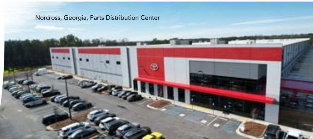
Norcross, Georgia, Parts Distribution Center

In late 2025, a new VPC at JAXPORT's Blount Island Marine Terminal began operations. The new facility modernizes vehicle distribution, expands capacity and provides greater flexibility to support future growth.